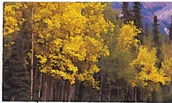
Figure 23 The trembling aspen tree reproduces from its roots.

Figure 23 shows an example of plant reproduction using roots. The trembling aspen forest you see here is actually a single individual. The roots of this one tree produced shoots that grew into the thousands of trees in this forest.